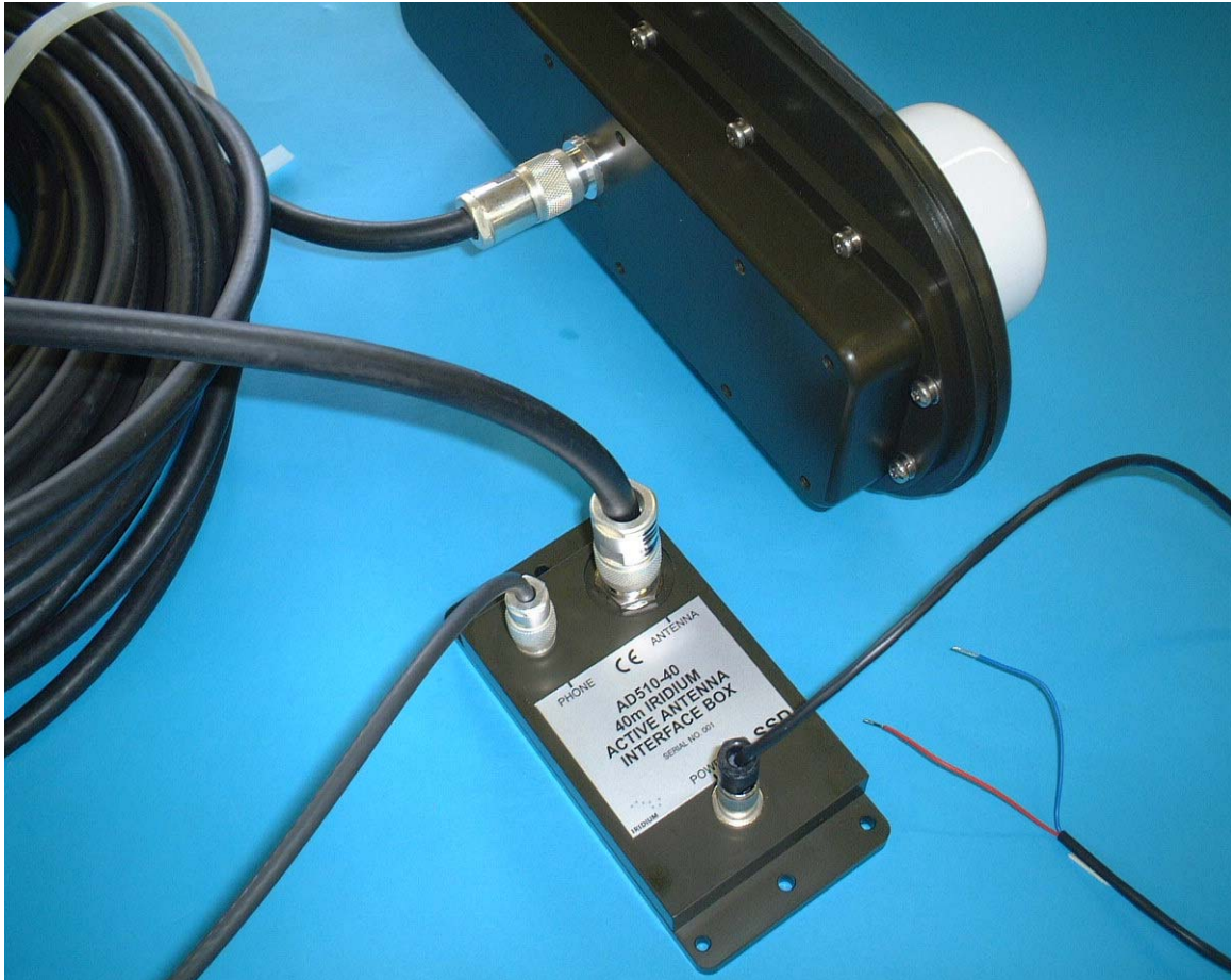
Figure 3. RST510-40 voltage regulator and break-in for use with +9 to 36Vdc supply. The case is hard anodised aluminium and has fixing flanges. A 40m coil of RG213U cable is shown connected to an RST520 active antenna (top). The handset interconnect is shown trailing from the TNC to the bottom left, whilst the flying lead for connection to 9 to 36V dc supply is shown cutting the frame to the right.