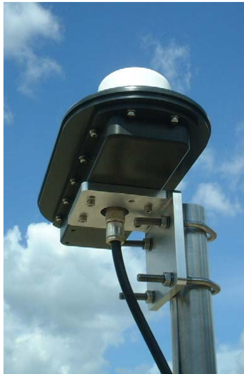
Figure 2. RST520 active Iridium antenna with mounting bracket and RG213U coaxial down-lead