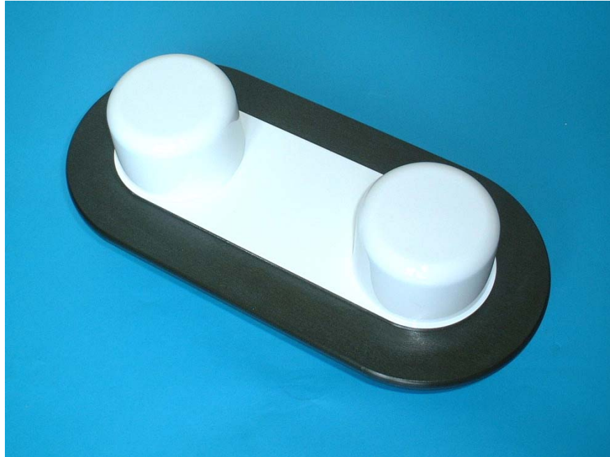
Figure 1. RST520 Active Iridium antenna