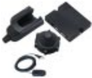
HANDS-FREE CAR KIT